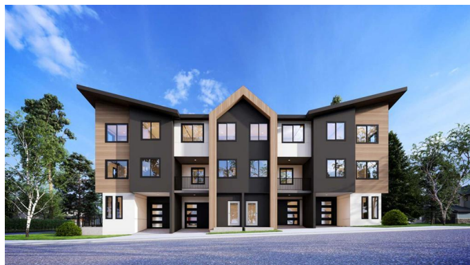
97 23 St NW, Calgary, AB

Thoughtfully designed with high-end finishes, this home showcases luxury vinyl plank flooring, elegant feature walls, premium tiles, upgraded carpet, and a designer backsplash. The single attached garage adds to the convenience.